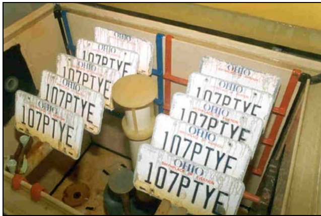
Salt Spray Testing for Corrosion Resistance

Many clients who have the capabilities to perform their own testing find it cost efficient to have the testing conducted by CTL Engineering. This also provides the added benefit of increased credibility that independent laboratory testing provides. You can be assured that your test results are treated with the strictest and utmost confidentiality.