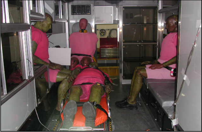
Ambulance Safety Testing

Some of the various items we have tested include automotive and aircraft components, fasteners, tools, pressure vessels, computer equipment, appliances, lifting devices, candles, building components and medical equipment.