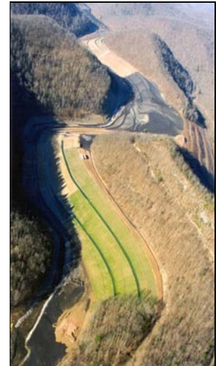
Taylor Creek Impoundment 2003 OSM National Abandoned Mine Land Reclamation Award Winner